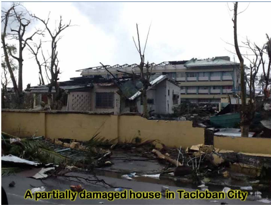
A partially damaged house in Tacloban City