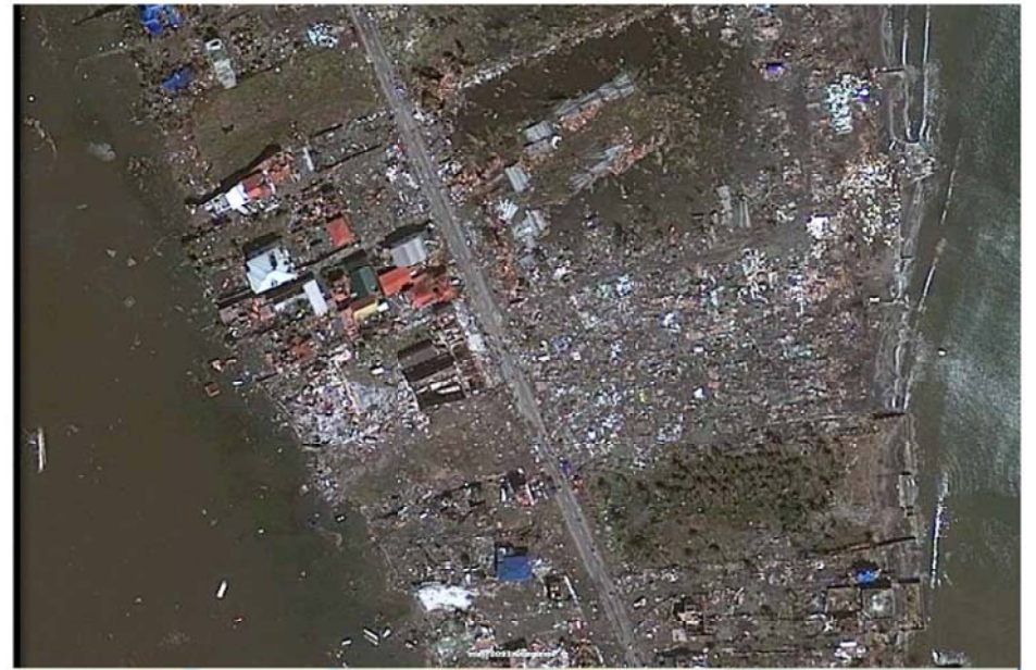
... and after...