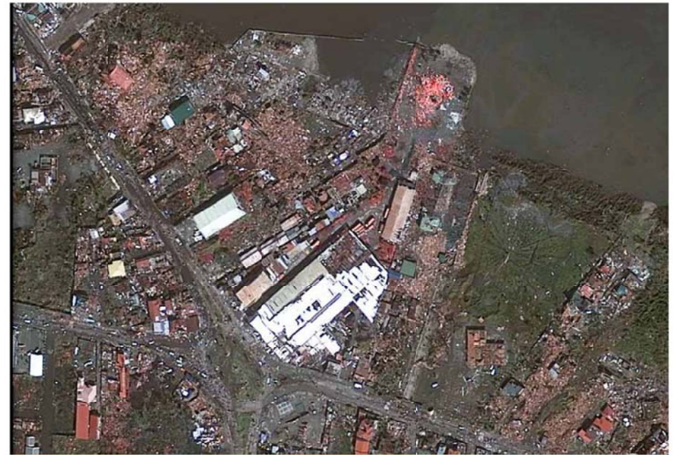
... and after...