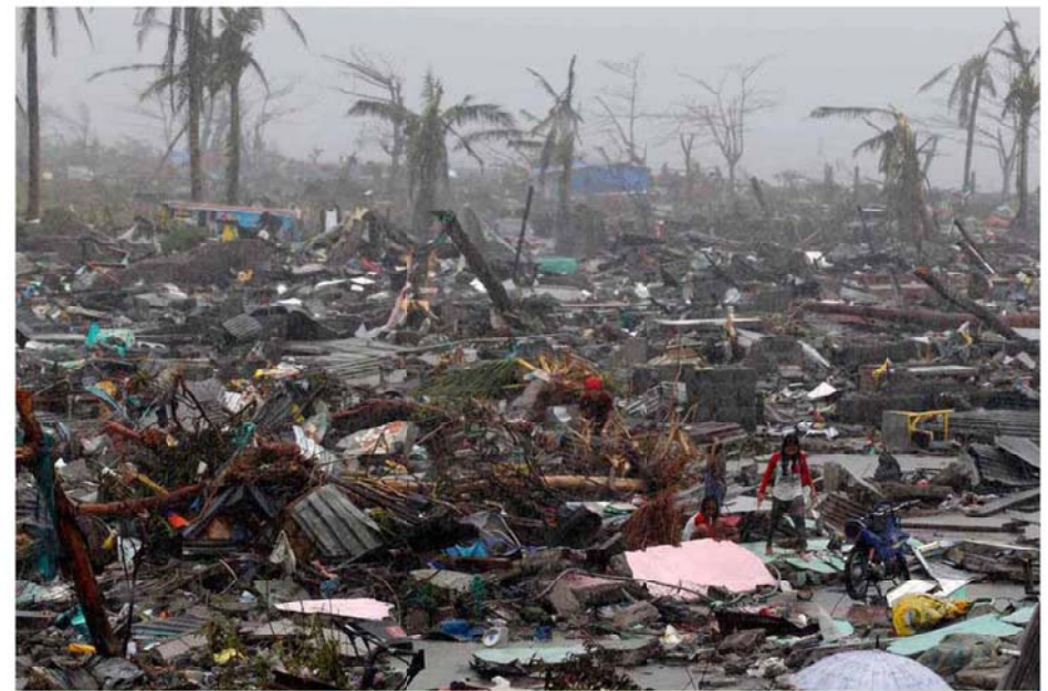
Houses-turned-debris & rubbles in Tacloban City