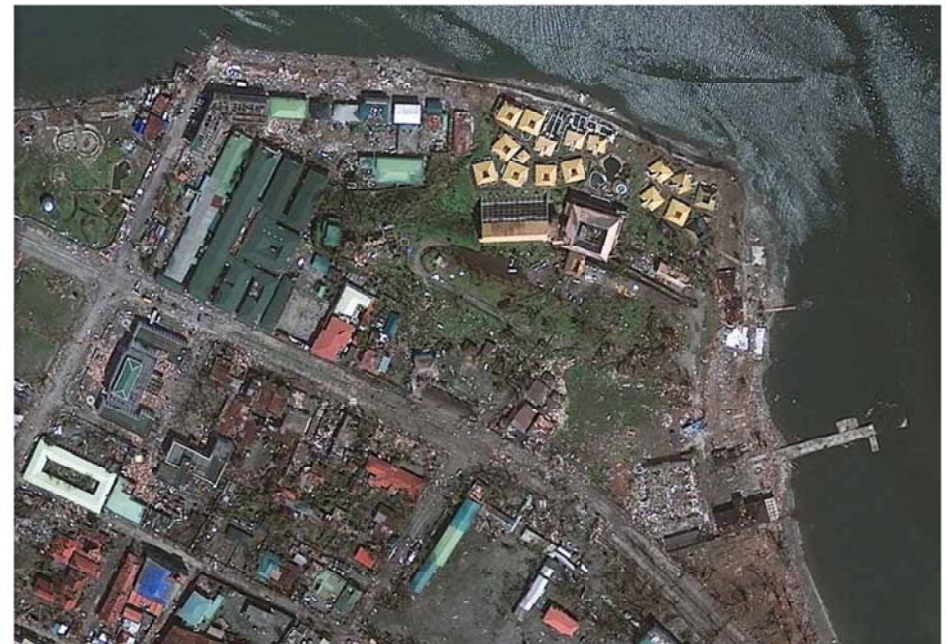
... and after...