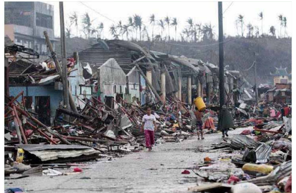
Affected Communities in Tacloban