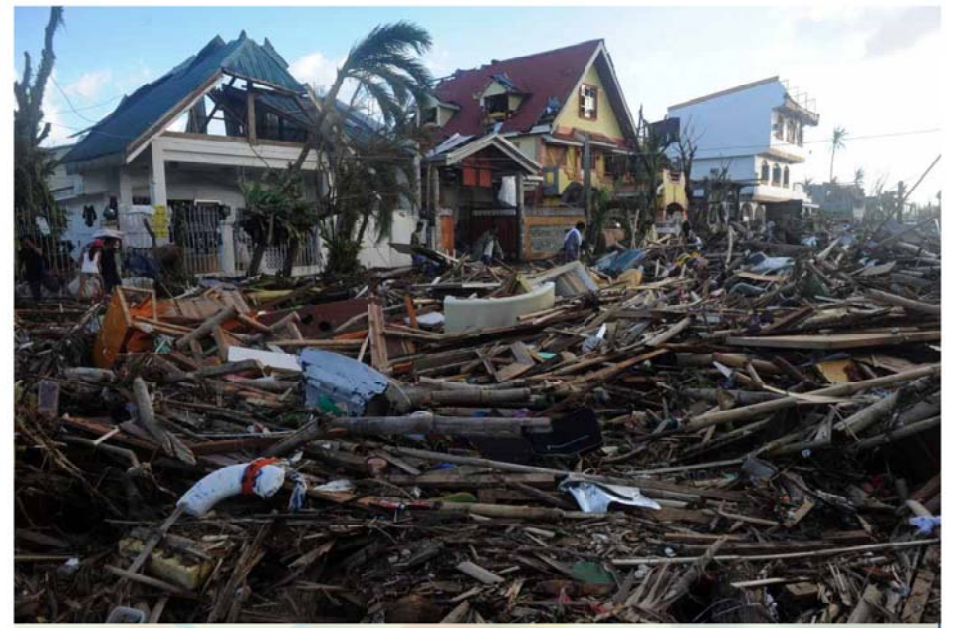
Debris and rubbles in Palo, Leyte