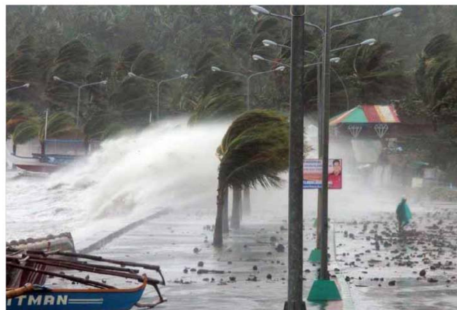
Storm Surge battering the coastline of Tacloban