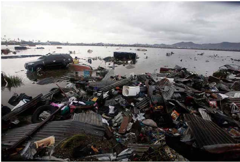
A man searches for belongings washed ashore