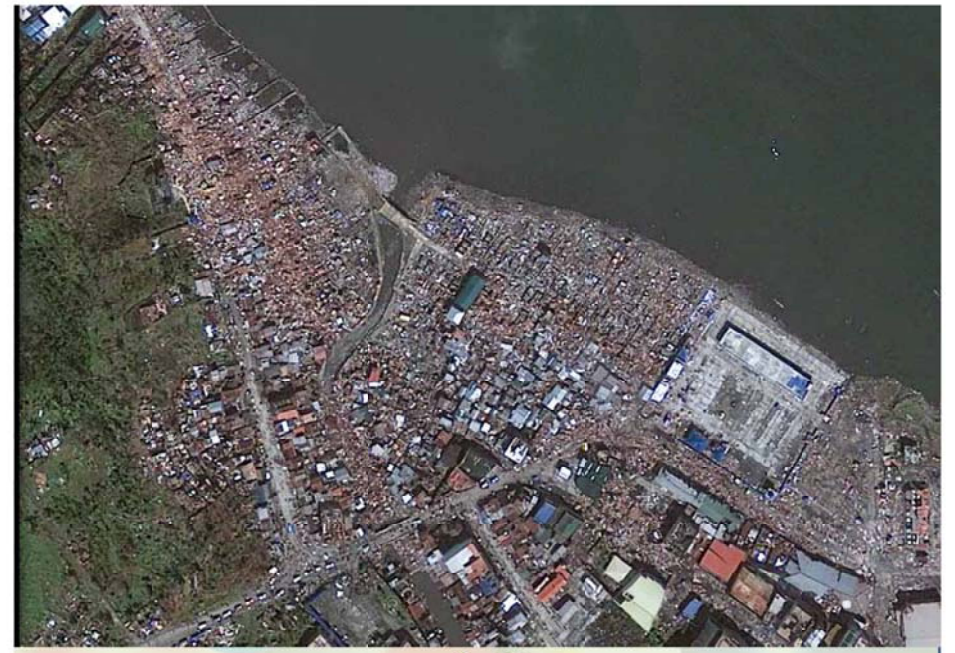
... and after...