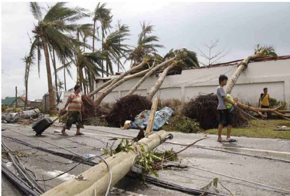
Fallen trees & electric posts in the aftermath of TY Yolanda