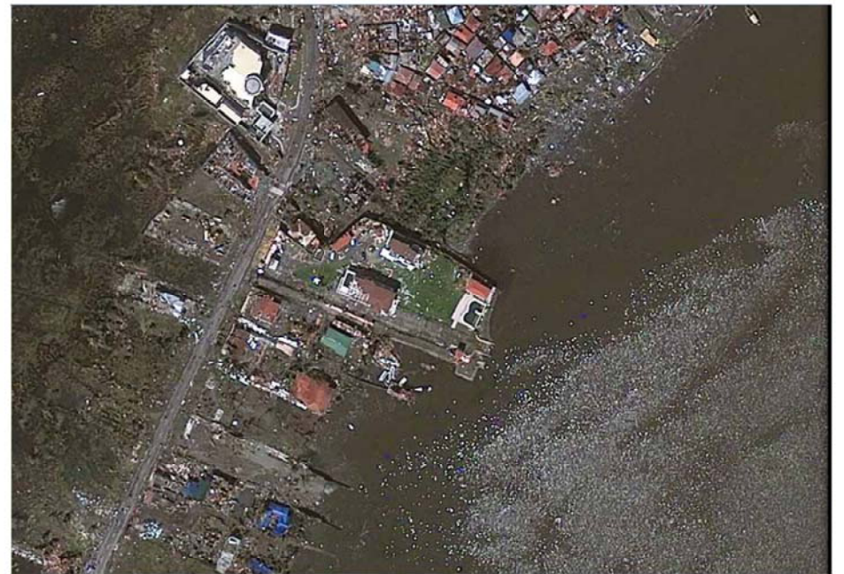
... and after...